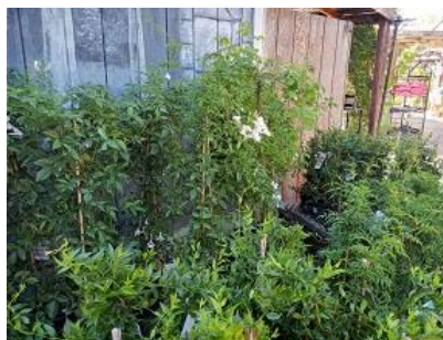
Vines, including Wisteria