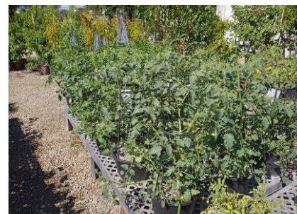
Getting a later start? These tomatos will catch you up!