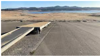
Folsom Lake, June 2021

California, the golden state, the state of redwoods and sandy beaches. The state that produces most of the food for the entire USA and for export. Agribusiness is our largest economy-it brings in more money than anything else in the state-even Hollywood and tourism. The state that has had a 300 plus year of cyclical rain and drought. The state that is on fire more than not. It is also the largest user of our water supply. Home landscapes and playing fields use only about 2% of the 40% the state uses for agriculture. 50% of our water goes to environmental issues, 10% of the water is for urban use. As a 4 th generation Californian, I love it here! We are heading into another drought and it is best to be proactive as a homeowner and get ready.