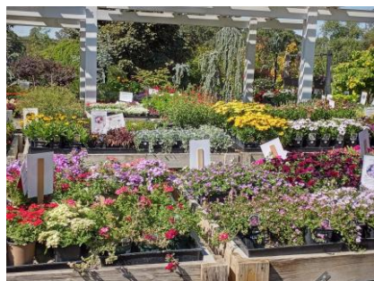
Color for the Heat